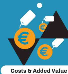
Costs & Added Value