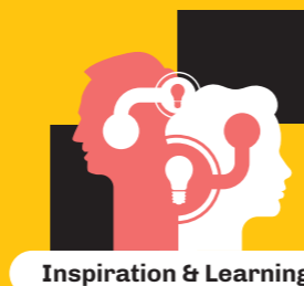
Inspiration & Learning